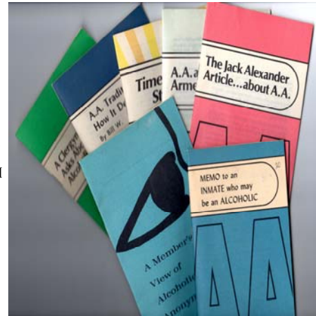
Some of the pamphlets found stuffed away.

I am writing this just to remind other groups, or members who have items boxed up, and forgotten items that you may not have any use for to pass them on to Archives. Big or small items are always welcomed. I have taken a few that actually were needed or helpful to Archives. I know that those items forgotten about could be a BIG asset to HISTORY. So if you run across any of those forgotten boxes Please pass them on.